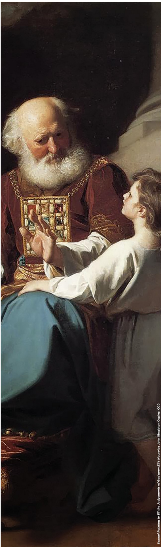
Samuel Preaching to Eli the Judgements of God upon Eli's House by John Singleton Copley, CCO

INVITATION We are all called to a life of holiness. But it's not always easy to grow in holiness and strengthen one's relationship with God on our own. Consider reaching out to your parish and asking about spiritual direction - a spiritual director will help you fine tune your ears to be more attentive to the Lord's voice.