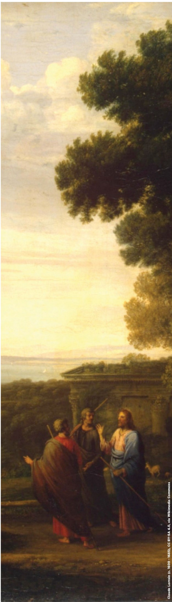
Claude Lorraine (c. 1600 - 1682)

ACCOMPANY How can we imitate Christ in the way he reached out to his disciples who were wracked with fear and doubt? Perhaps we know somebody who feels trapped by sin, or unworthy of good things, or a constant failure. Let's be honest, sometimes that person is us! We all need encouragement and accompaniment from time to time. Find a way to be that encouragement for someone this week who's having a tough time. You don't have to fix their problems; just listen, let them know you care, and offer a sincere and hopeful encouragement that brighter days lie ahead.