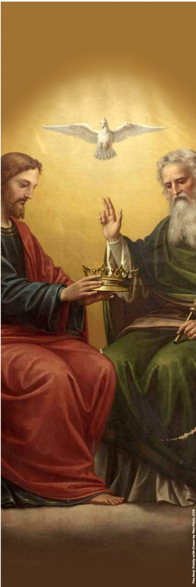
The Holy Trinity with Crown by Max Ernst, CCO

PRAY All Christian prayer is Trinitarian in nature: we pray to the Father, through the Son, in/by the power of the Spirit. Some prayers are very specifically written to include the Trinity/Godhead by name. The most recognizable one is this doxology, or the Glory Be: Glory Be to the Father, and to the Son, and to the Holy Spirit. As it was in the beginning, is now, and ever shall be, world without end. Add it to your daily prayers.